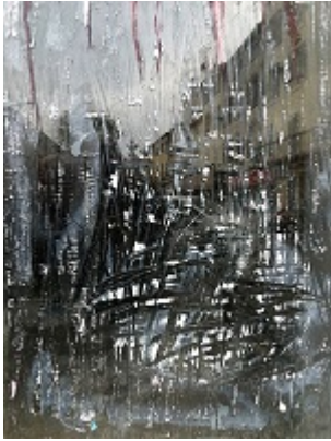
Smearred Window archival print on watercolor paper 34" x 25.5", 2016