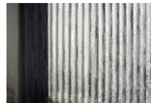
Particle Wave archival print on watercolor paper 22.5" x 34", 2016