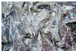
Mountain Flow archival print on watercolor paper 22.5" x 34", 2016