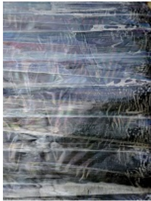
Drift archival print on watercolor paper 34" x 25.5", 2016