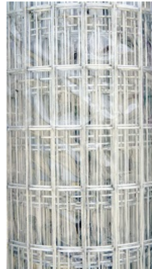
Fence - light archival print on watercolor paper 34" x 19", 2016