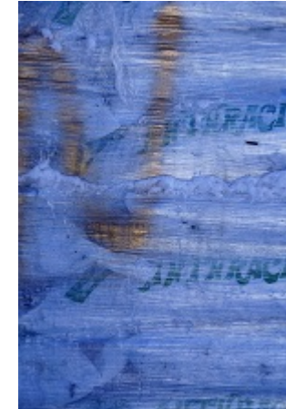
Trace archival print on watercolor paper 34" x 25.5", 2016