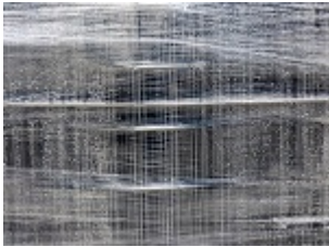
Fence with Bubbles archival print on watercolor paper 26" x 34", 2015