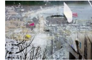
Golf Juan I archival print on watercolor paper 22.5" x 34", 2016