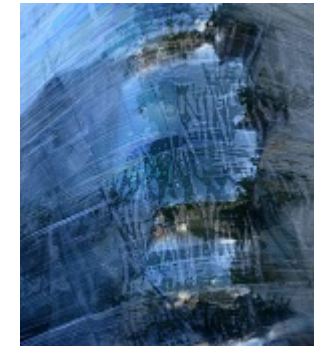
Blue Column archival print on watercolor paper 34" x 25.5", 2016