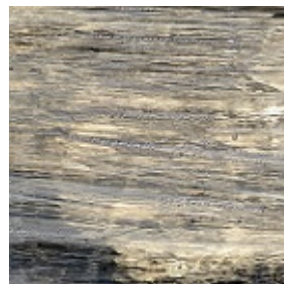
Ocean at Dawn archival print on watercolor paper 18" x 18", 2016