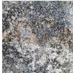
Stone Surface archival print on watercolor paper 34" x 34", 2016