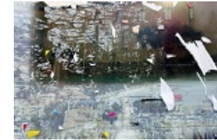
Golf Juan II archival print on watercolor paper 22.5" x 34", 2016